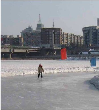
Skating on Hun He river, China