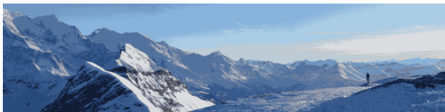
Flaine