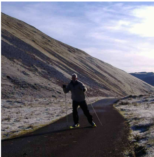
Roller Skiing in Coquetdale (30 th Nov)