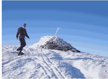
Kilhope Law Summit, 6 th Feb